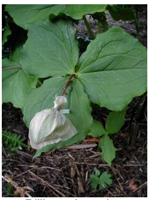
Trillium seed protection.

I am determined to scupper their raid this year and have taken the precaution of tying some horticultural fleece, or in the case of this cannie Scot, a recycled tea bag, to protect the seed.