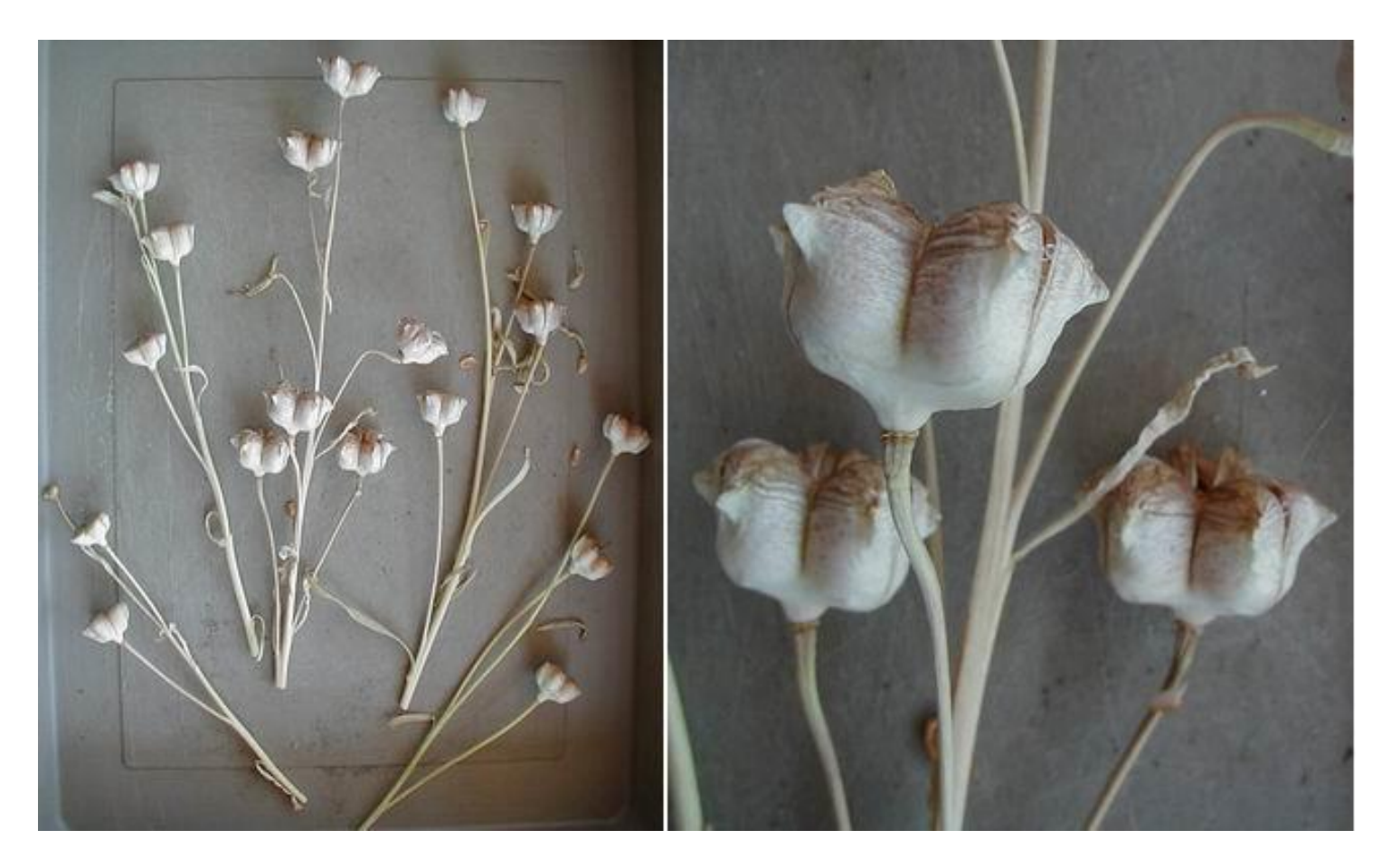
The seed pods of the frits are also worth enjoying: Fritillaria pluriflora seed pods.