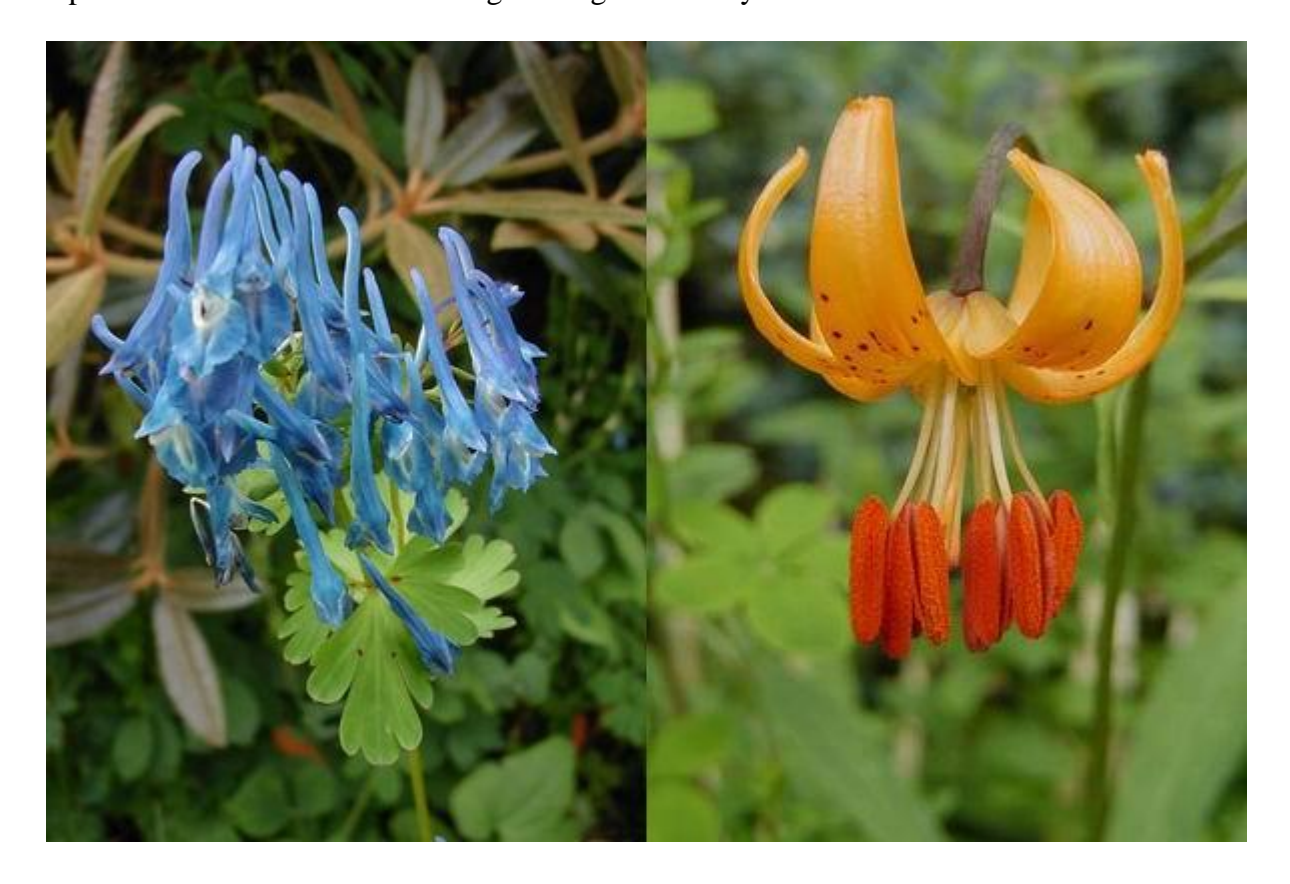
Corydalis elata (omeiana) and Lilium medeoloides.

Finally a couple of the bulbs that are flowering in the garden today.