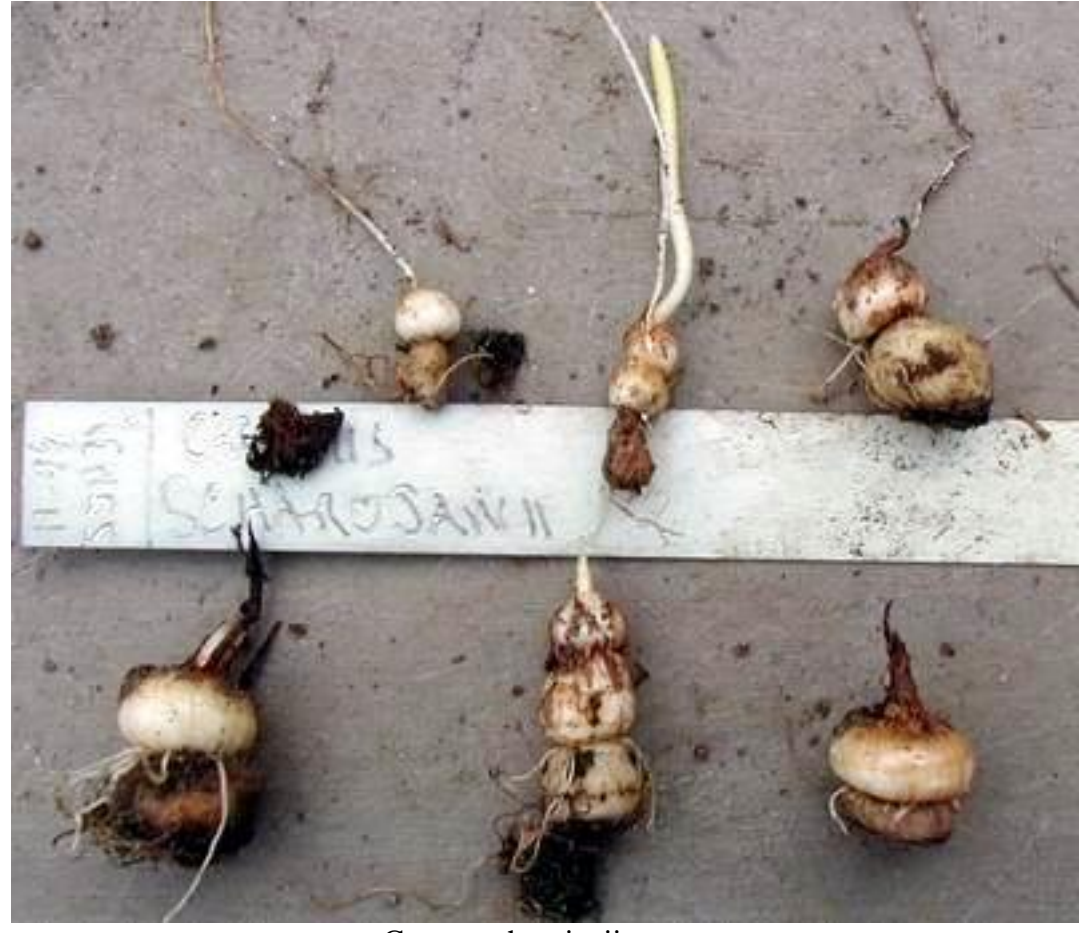
Crocus scharojanii corms

It is always wise to handle your bulbs carefully when repotting as some species will have now roots emerging even before this springs' leaves have died down. Crocus scharojanii is on of these plants, you can just see the new, white, roots emerging from the new corm and the shoots already extending on the two in the centre. It is also fascinating to see the stack of the previous few years corms on these seedlings that have not been repotted since 2001. Crocus scharojanii is the first of the autumn crocus to emerge for us usually in August.